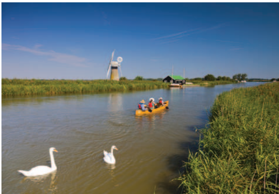
Canoeing on the Broads - Tom Mackie

The trails cover the more tranquil reaches of the river system