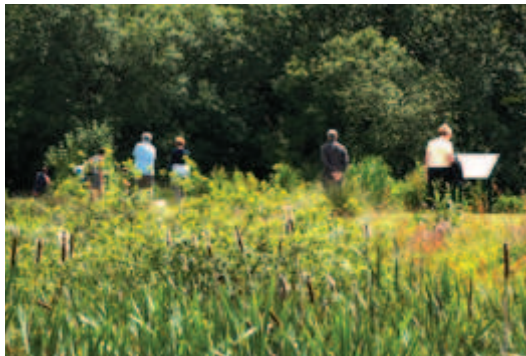
Burrs Country Park - NCA 54 - Manchester Pennine Fringe

These landscape profiles provide a unique, free and highly accessible information resource, highlighting how England's varied landscapes function and how they can be cared for. They can provide useful background information, all in one place, when planning guided walks and tours across England.