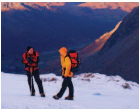
Walkers above Borrowdale - NCA 8 - Cumbria High Fells