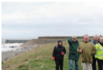
CLAF members take a blustery walk along the England Coast Path at Maryport.

LAF members provided personal views and feedback from their own experiences of walking along that section of coast at the start of the process, which helped Natural England identify specific issues and opportunities. During the planning process LAF members helped to identify landowners when more information was needed and continued to advise on progress in advance of the report to the Secretary of State.